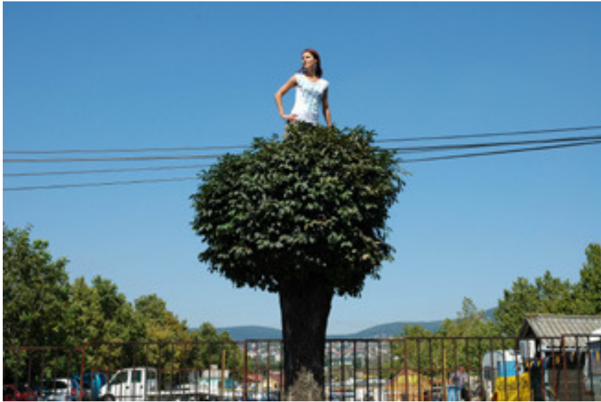
Cecylia Malik, Tree 332 , performance / photograph, 2010.