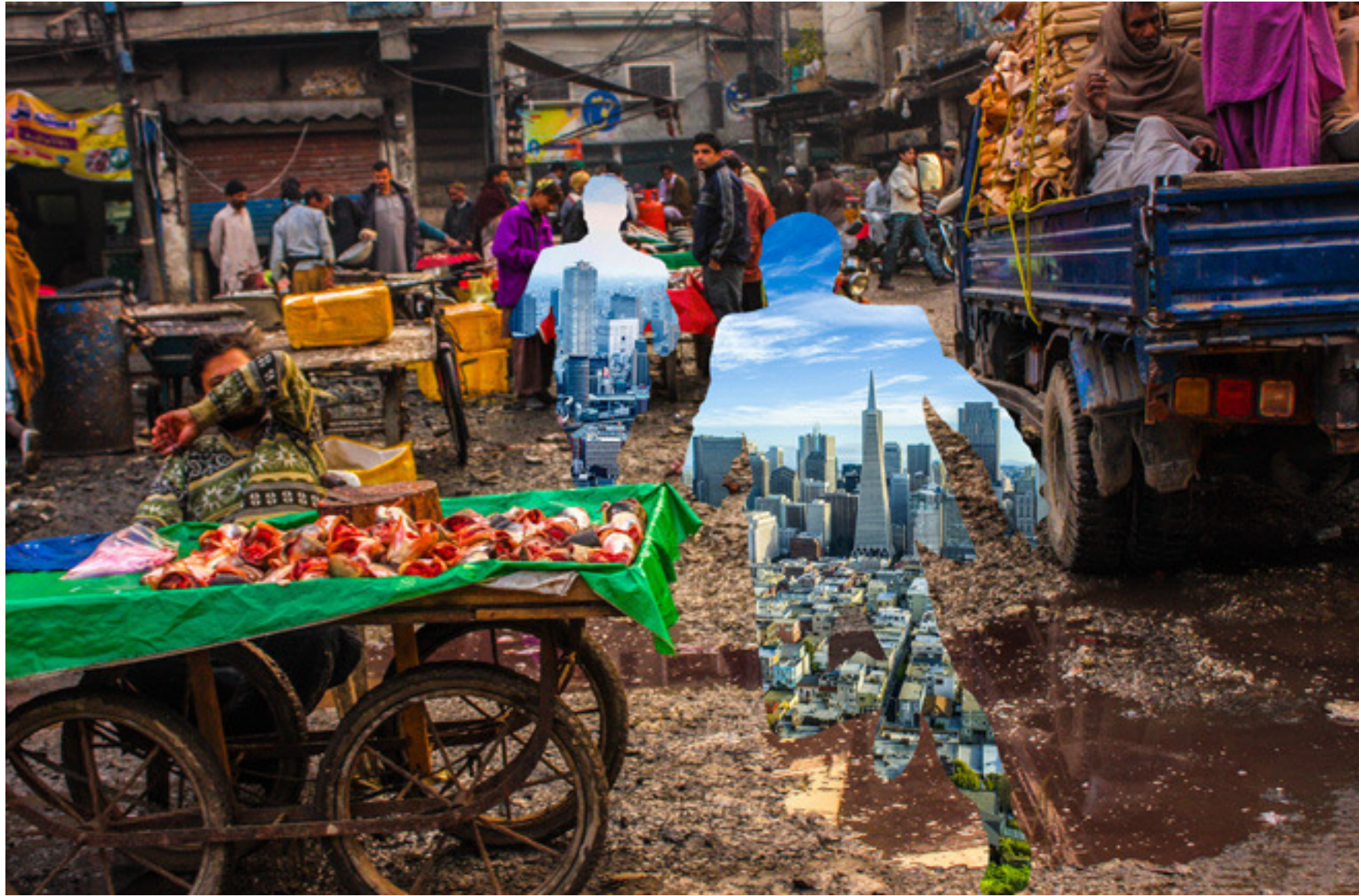
Nauman Abid, For a better future together , C type print, variable size, 2014. Courtesy of the artist